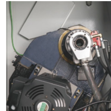
CS axes with hydraulic brake