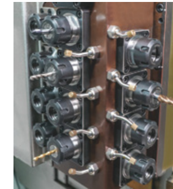
4+4 Live tools group