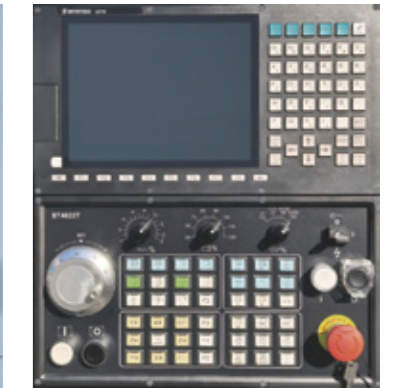
SYNTEC 22TB cnc controller