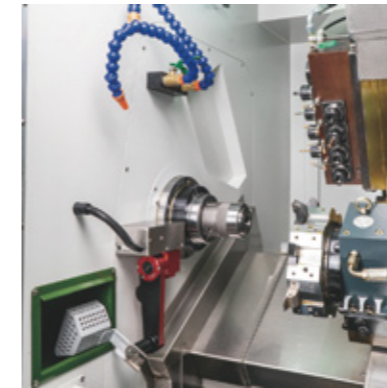
CL42 collet chuck with parts catcher