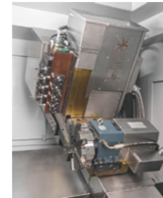
8T tool turret with live tool group