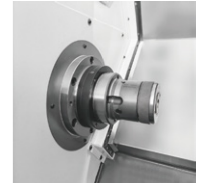
CL42 collet chuck