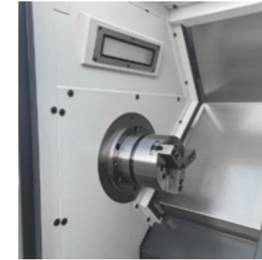
6" hydraulic chuck