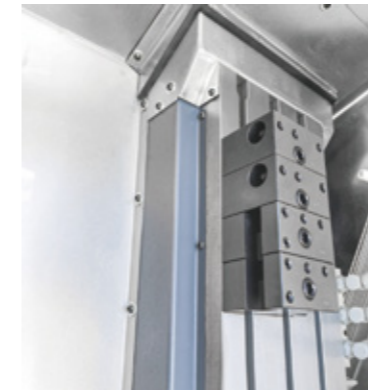
Gang tool holders