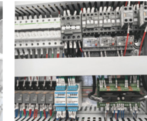
SCHNEIDER brand electricity parts