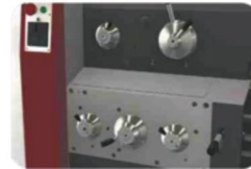
24 class speed