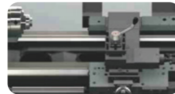
High quality guideway