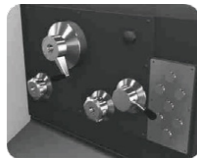
14 class speed