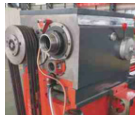
3 class gear spindle