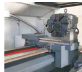
8 station tool turret