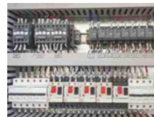
SCHNEIDER electricity parts