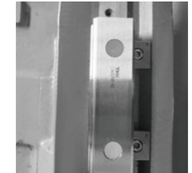
THK brand linear guideway