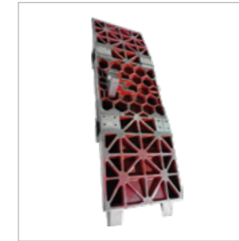
MEEHANTE cast iron & flakeolate structure