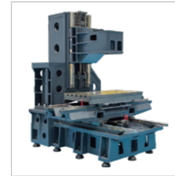
V11P large-span base & super wide column

TAIWANESE QUALITY, LINEAR GUIDEWAY, HIGH-END MODEL, HIGH RIGIDITY, HIGH PRECISION