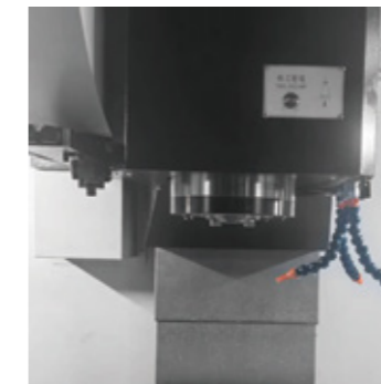
BT40-160 short-nose spindle