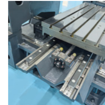
THK brand C2 class ball screw