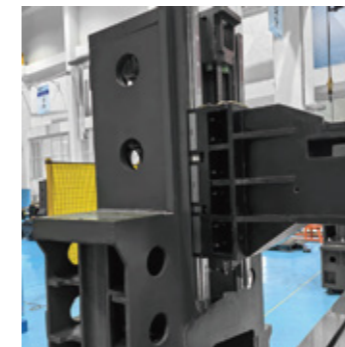
Column step to support tool magazine