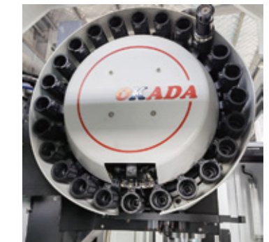
24T ARM type tool magazine